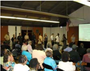
Los Angeles County Representatives at hand to answer resident questions during the 2nd District meeting at Athens Park on September 18, 2008.

The end of fall usually marks the period of the year when things begin to wind down before the winter holidays. For the Community Development Block Grant (CDBG) Division, the end of fall however, signifies that the Community Meetings are in full swing. No time for winding down, here!