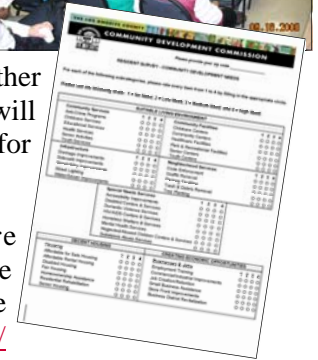
Above, residents fill out the Community Survey at the 3 rd District meeting in West Hollywood on September 16, 2008.